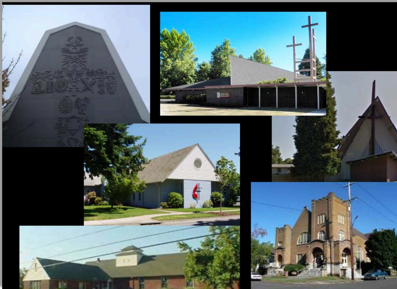
Upper row left to right: First UMC Eugene, Wesley UMC, Middle: Coburg UMC, Trinity UMC Lower: Junction City UMC, Ebbert UMC Springfield

Each faith community has its story.. its personality..It's struggles and its successes.