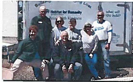
An InsideOut crew hard at work last April at a Habitat for Humanity build.