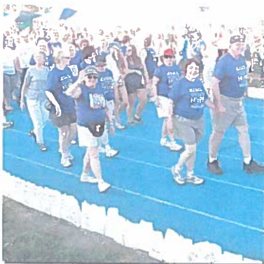
First UMC'ers walk in the Relay for Life