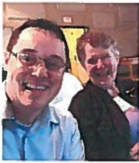
Plenty of smiles at Annual Conference!