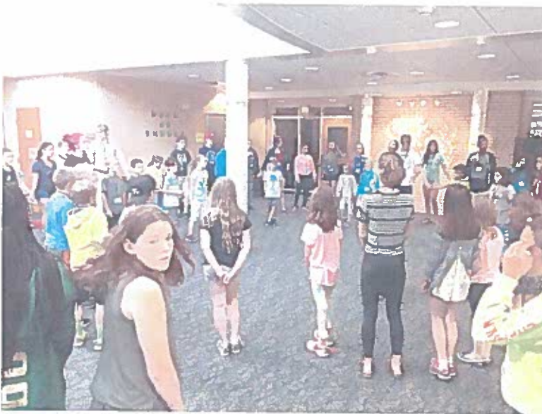
Our volunteers and kids had a fabulous time at Peace Village!