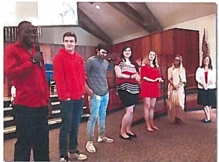
We enjoyed hearing from our graduating students!